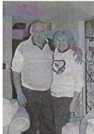
Our kind host and hostess.