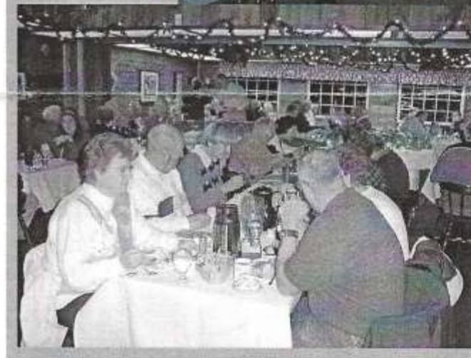
Left: Club members enjoying the Christmas Dinner Party at the Country Gentleman.