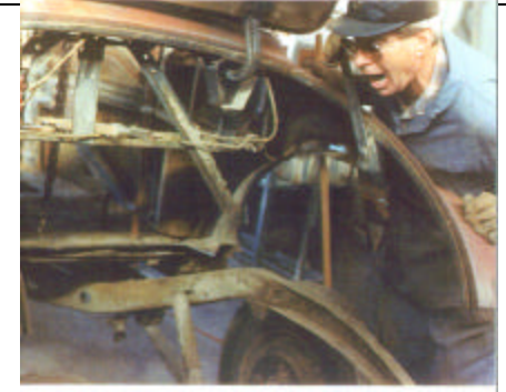
Great choice, but where's the trunk