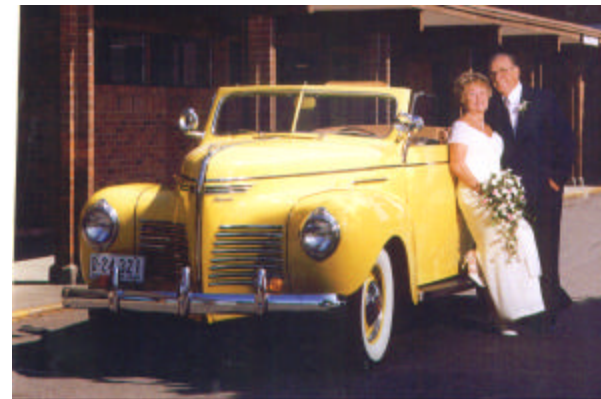
THE WEDDING CAR