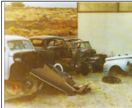
These are my choices???

This article is turning out longer than I thought, so I'm going to close here and continue next month.