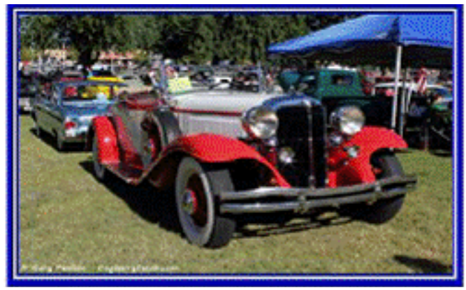
Best of the 30's