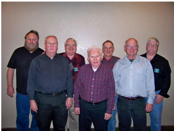
2014 Board of Directors